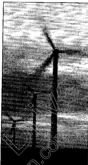
PLENTY OF SPIN: Turbines at Woolnorth in North-West.

In reality, there is a proposal for a power station on the Southwood site, which would use waste off the forest floor as fuel, waste that